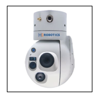
Chakshu Gyro-Stabilized gimbal camera