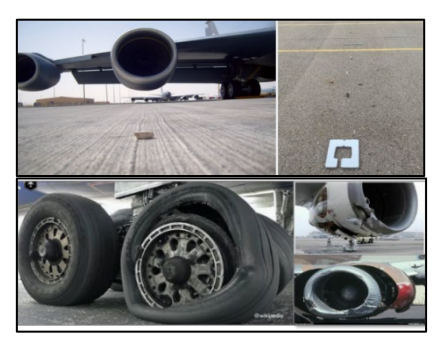
Damage caused by FODs