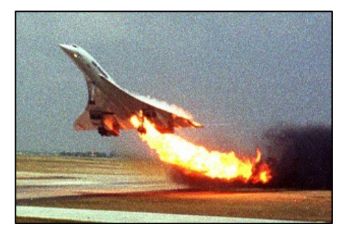
Flight 4590 accident