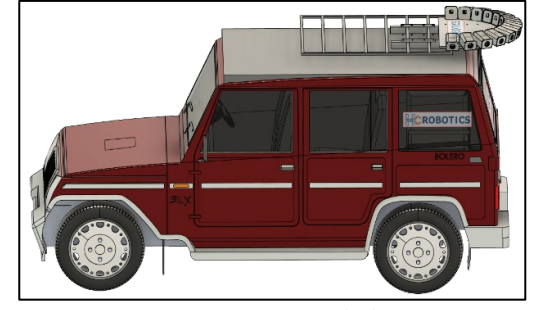
FOD Detection Vehicle

The system operates seamlessly without disrupting runway activities, minimizing delays and improving overall safety